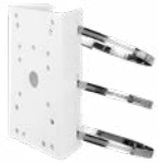
AT-100 Pole Mount Adapter