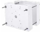
AT-101 Pole Mount Adapter