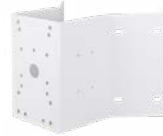
AT-200 Corner Mount Adapter